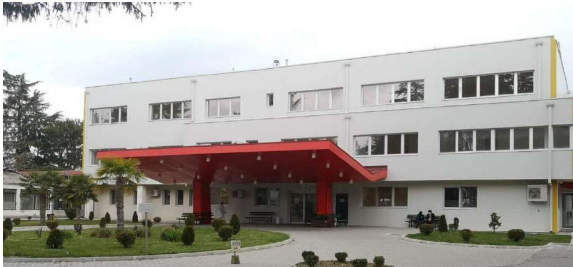
Specialized hospital for orthopedics surgery and traumatology "St. Erazmo" – Ohrid